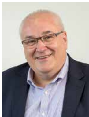
Ailean Dòmhnallach Cathraiche